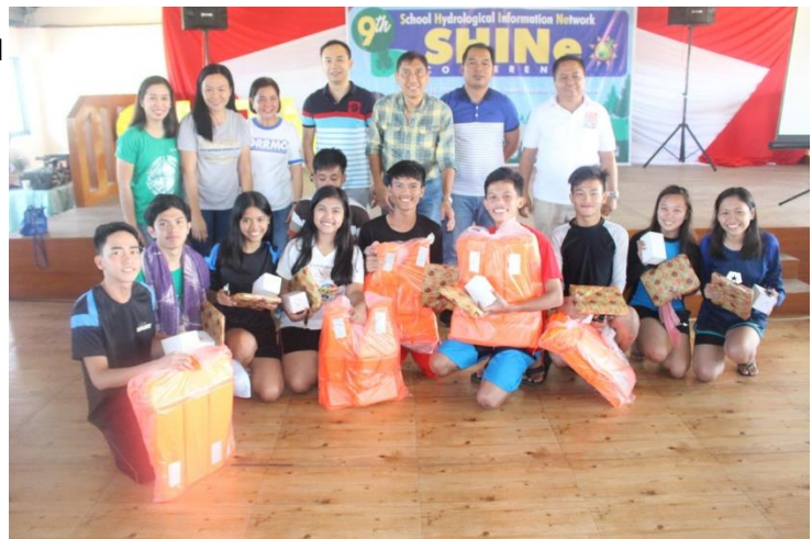
Champion Norzagaray National HS and Fortunato F. Halili NHS