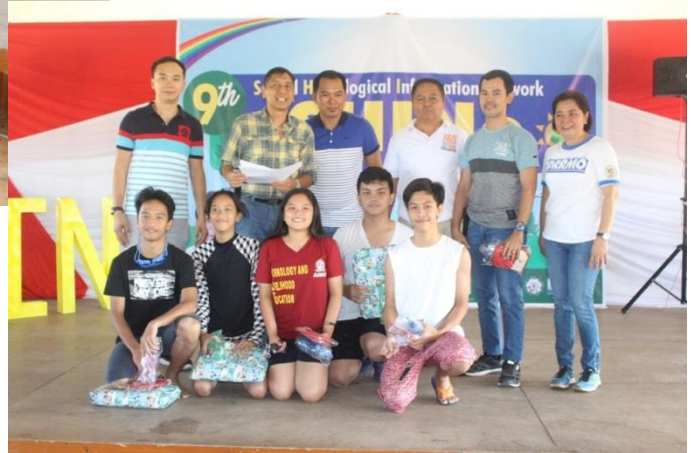
Angat National HS – Special Award (Diligent Award for being the best in year-round rainfall observations)