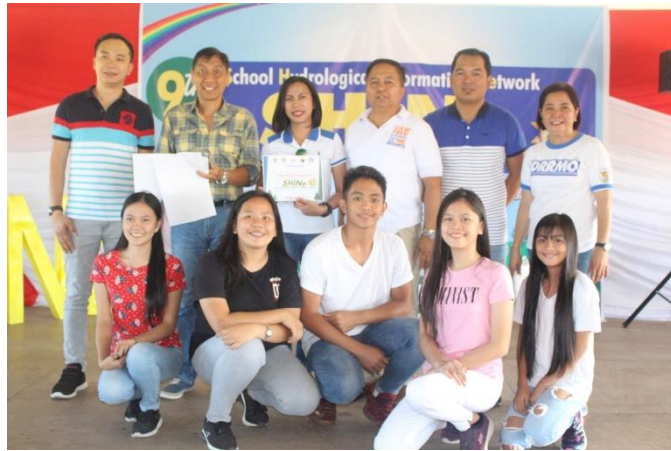
John J. Russell Memorial National High School, San Miguel, Bulacan