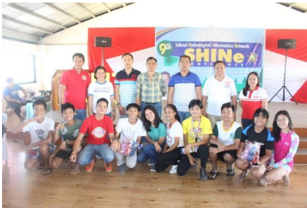
4 th Runner Up Frances NHS & Doña Candelaria NHS