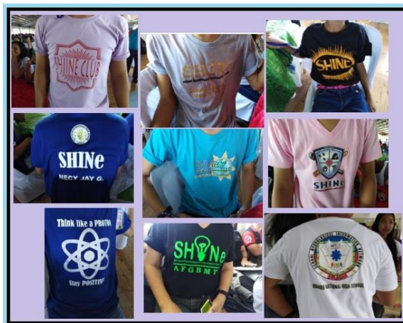
Cool SHINe Design Shirts for 2018