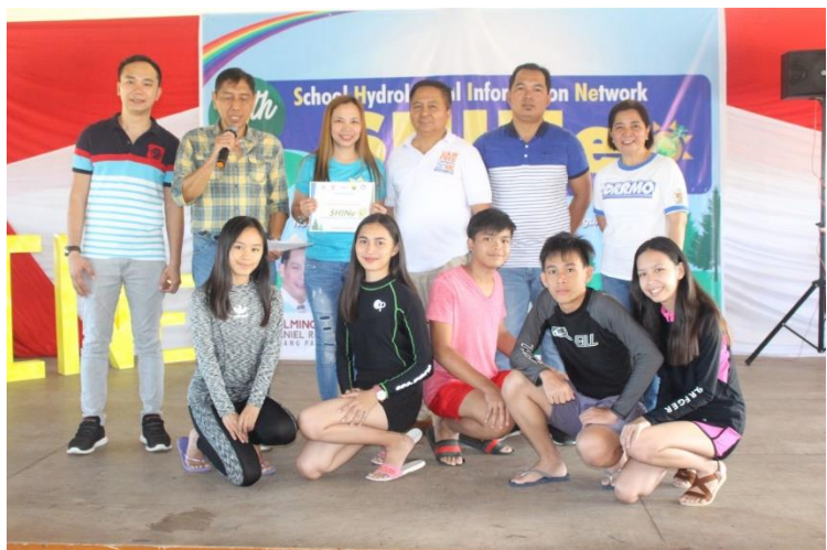
Bajet-Castillo High School, Pulilan, Bulacan