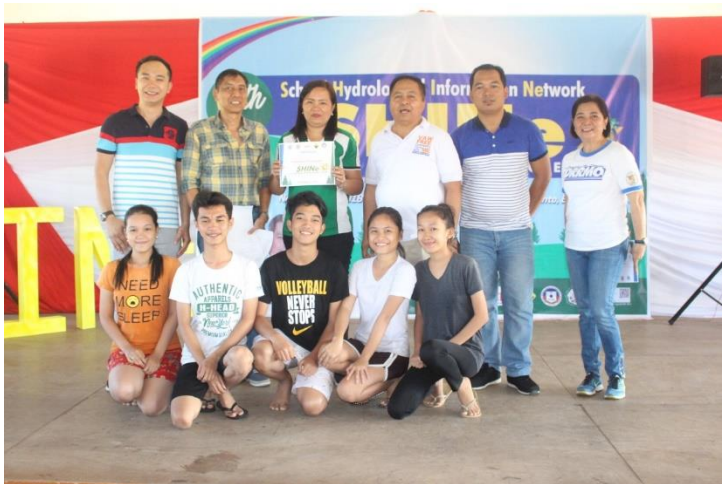
Tibagan National High School, Bustos, Bulacan