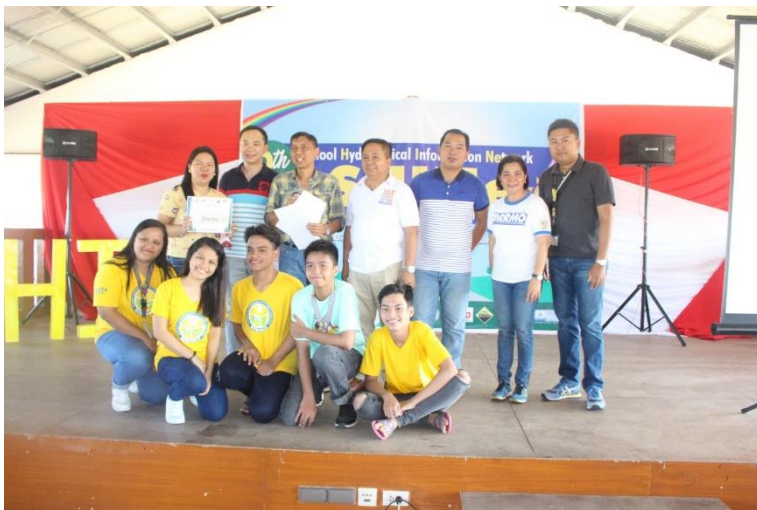
Dr. Felipe de Jesus National High School, Plaridel, Bulacan