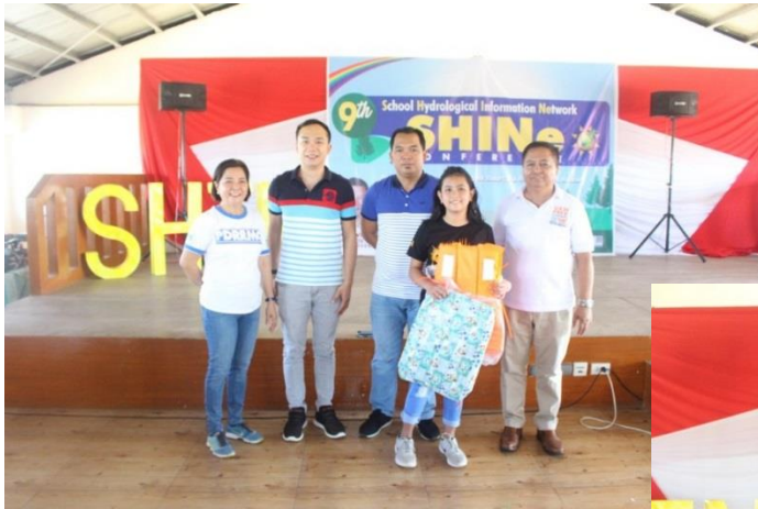
Pera o Bayong Winner