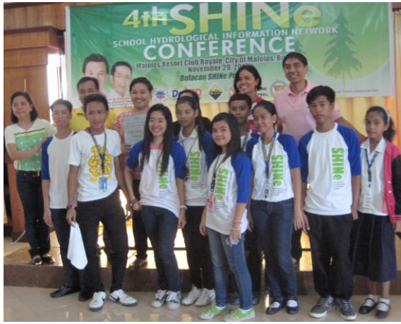
John J. Russell Memorial High School