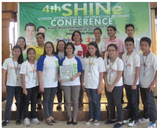
Fortunato F. Halili National Agriculture School