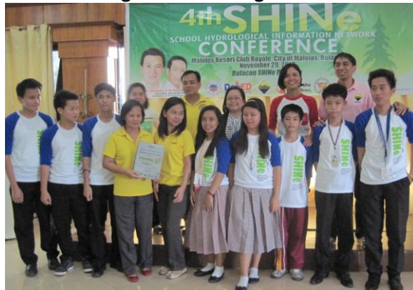
San Rafael National Trade School