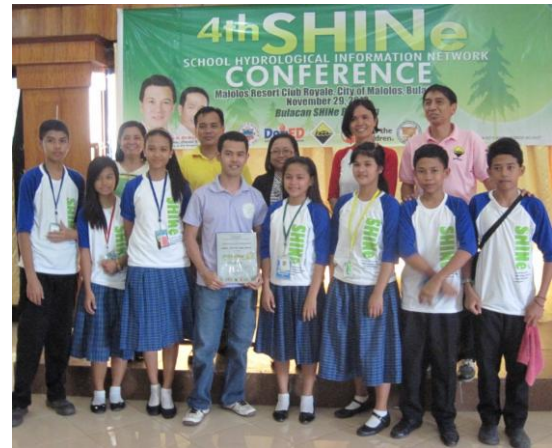
Angat National High School