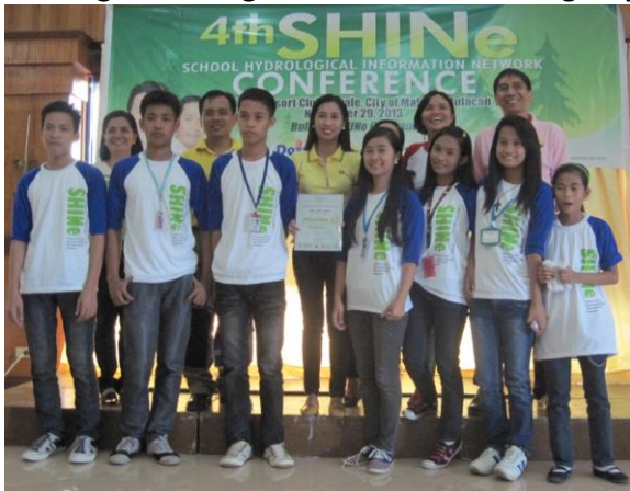
Akle High School