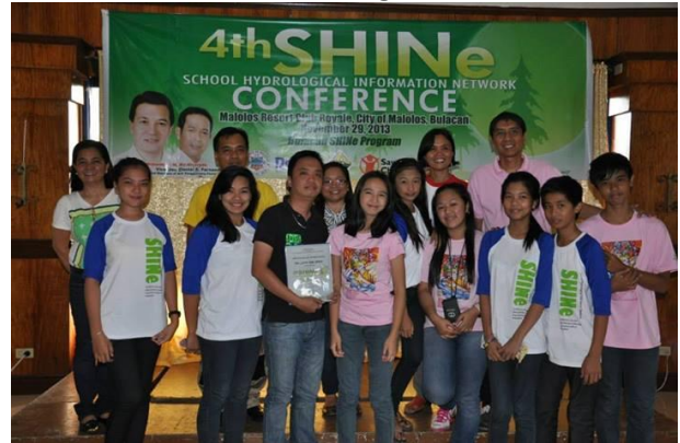
Sta. Lucia High School