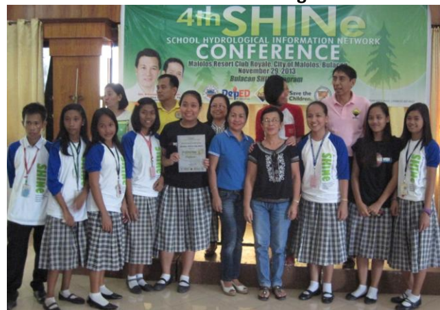
Binagbag National High School