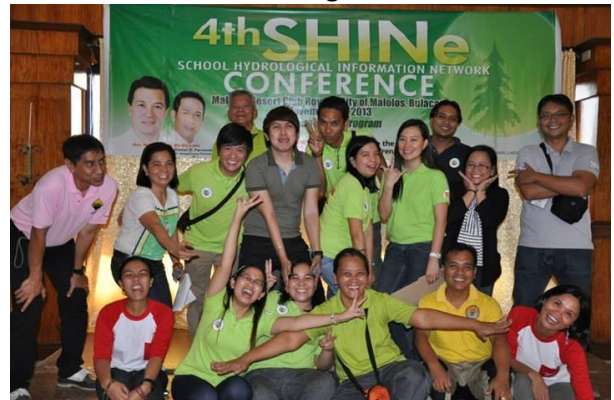
Guests and Conference Organizers