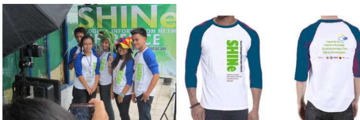
Photo booth pictures can be downloaded at Bulacan SHINe facebook (FB) site:

A special photo booth section organized by PDRRMO-Bulacan was set-up for the school SHINe delegates as part of conference freebies and event memorabilia / souvenir. SHINe T-shirts were also provided to the delegates courtesy of Save the Children.