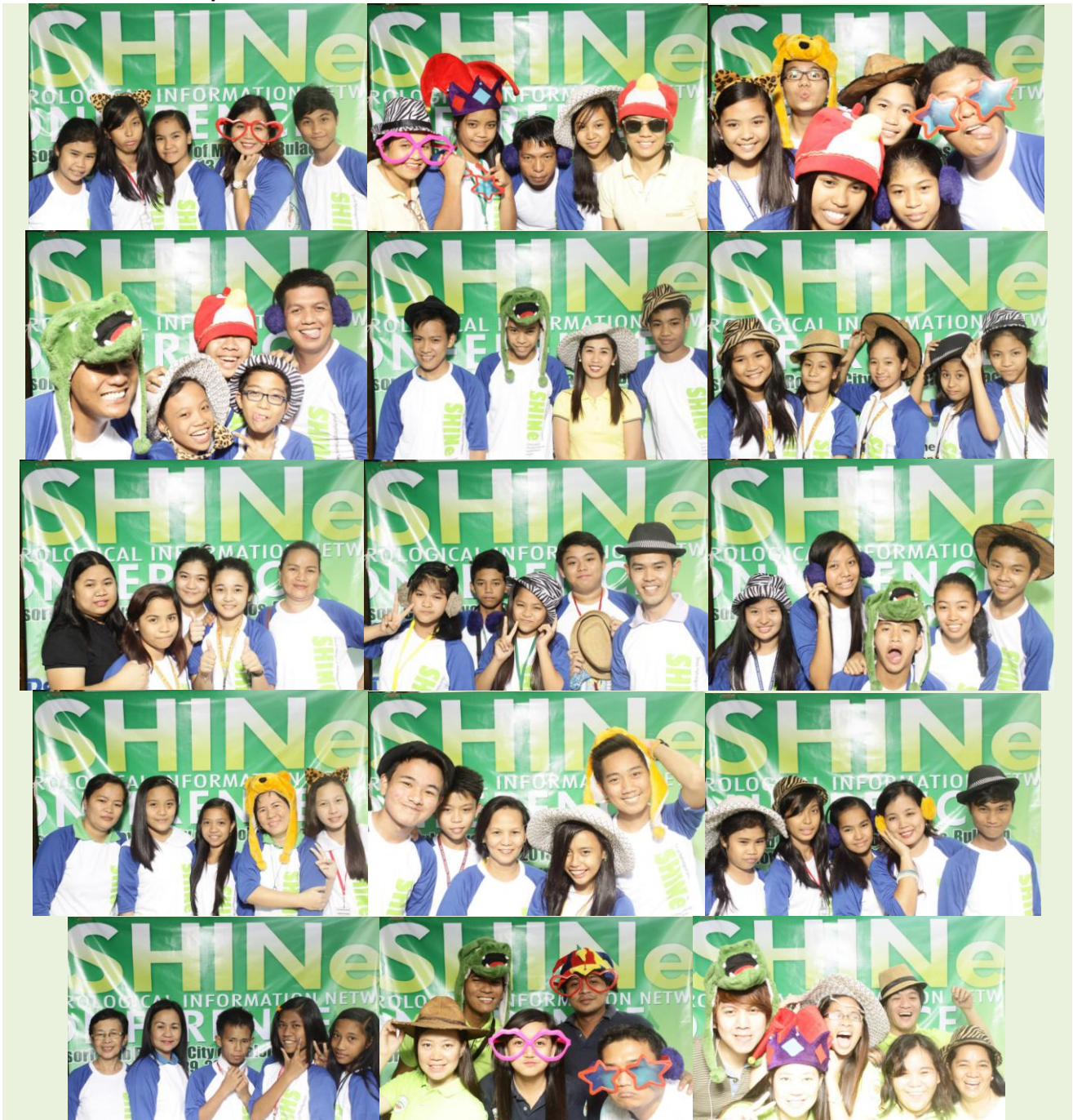
SHINe Photo booth pics...

This year's school SHINe groups that received brand new sets of Personal Computers were the Tibagan National High School and the John J. Russell Memorial High School of Bustos and San Miguel towns, respectively. The award is given to schools that have performed well during the year in terms of continued rainfall observations and has actively promoted the SHINe program not only within the school but in their community as well.