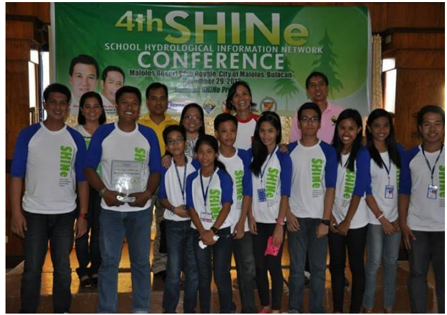
Sta. Monica High School