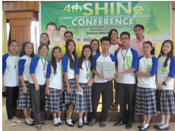
Tibagan National High School