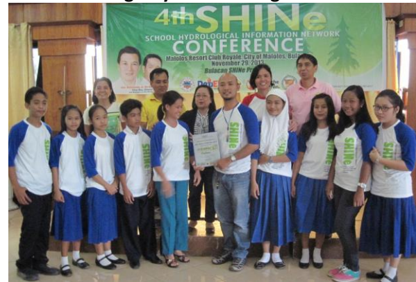
Doña Remedios Trinidad High School