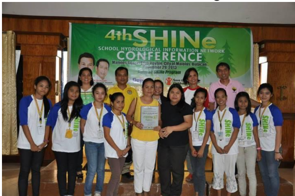
Vedasto R. Santiago High School