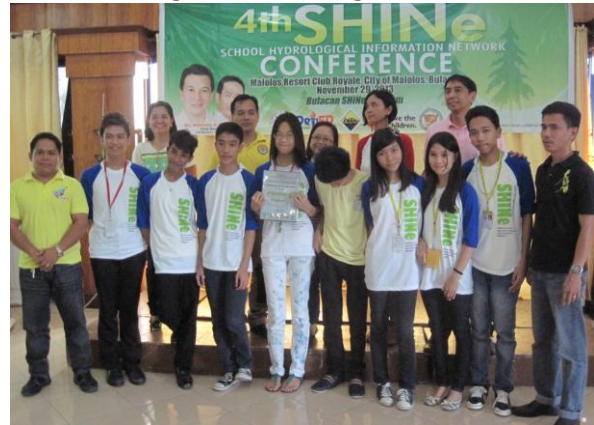
Norzagaray National High School