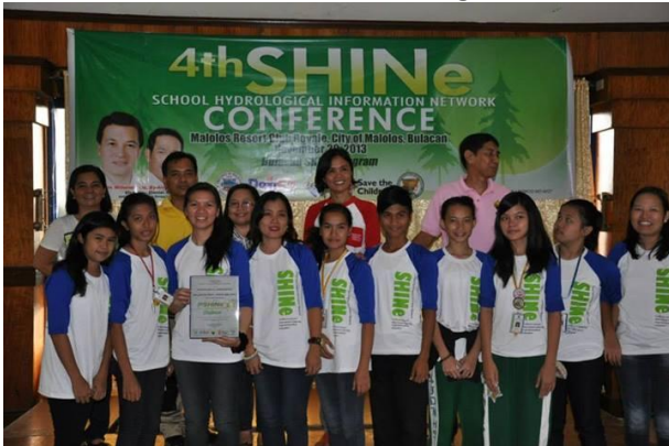
San Jose del Monte National High School