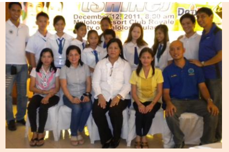
DRT High School