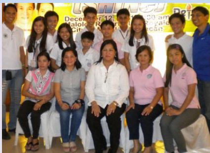
San Rafael NTS