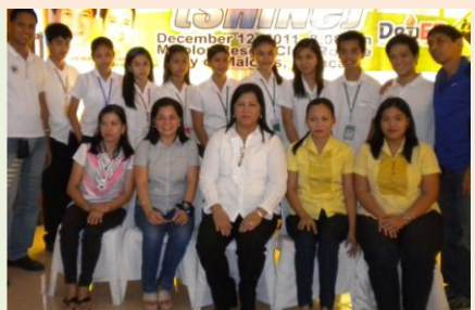
V. R. Santiago High School

The Provincial Government of Bulacan through the PDRRMO-Bulacan, DepEd (Division of Bulacan), and the PRFFWC would like to congratulate all school SHINe beneficiaries for their active participation in the 2 nd Conference on SHINe, Dec. 2011.