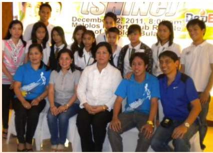
Akle High School