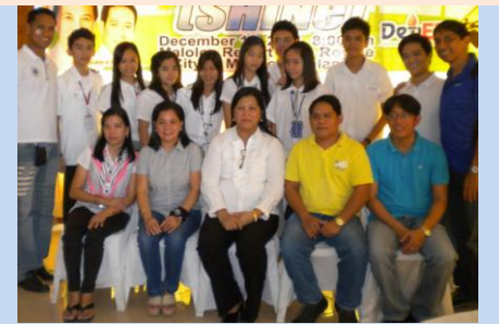
Norzagaray High School