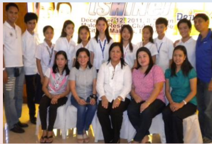
J. J. Russell High School