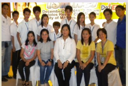
Tibagan High School