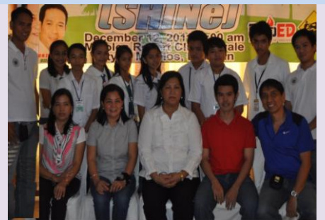
Tabok High School