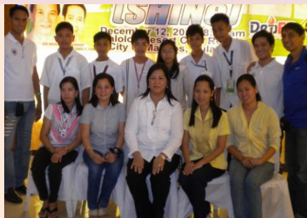
San Jose del Monte High School