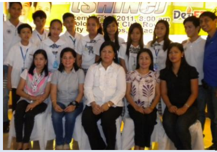
Binagbag High School